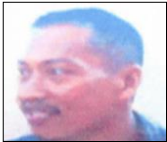
Ordasco ORDANTE ₱1,200,000.00

CC No.: B-17-2836; CR16H-9922, CR16H-9923 and CR16H-9925; Z-2823, Z-2824, and 2922