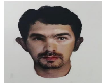
Jose Maria SISON